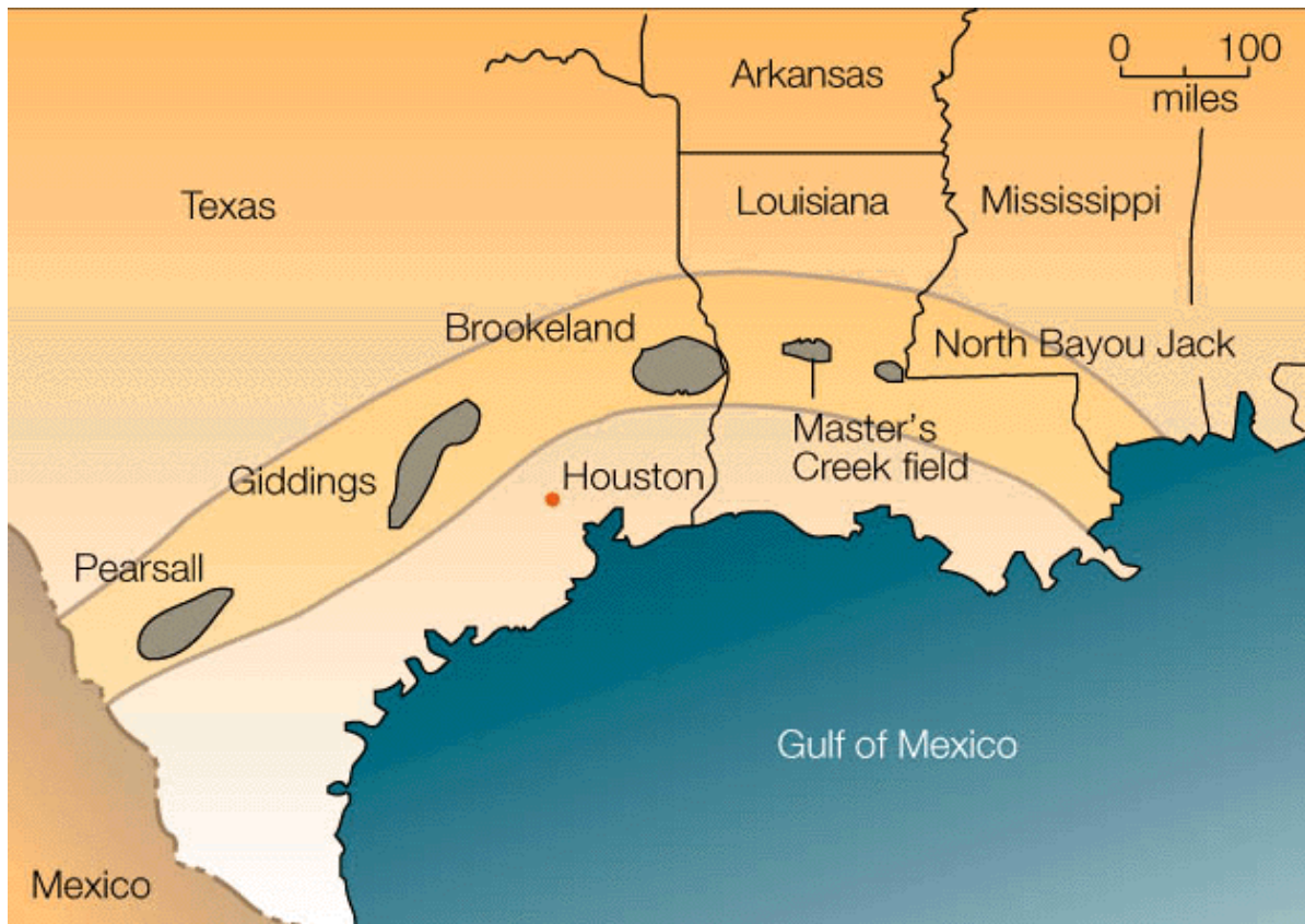
Figure 1: Commercial oil fields within the Austin Chalk trend showing the location of the Brookeland Field to the north-east of Houston.