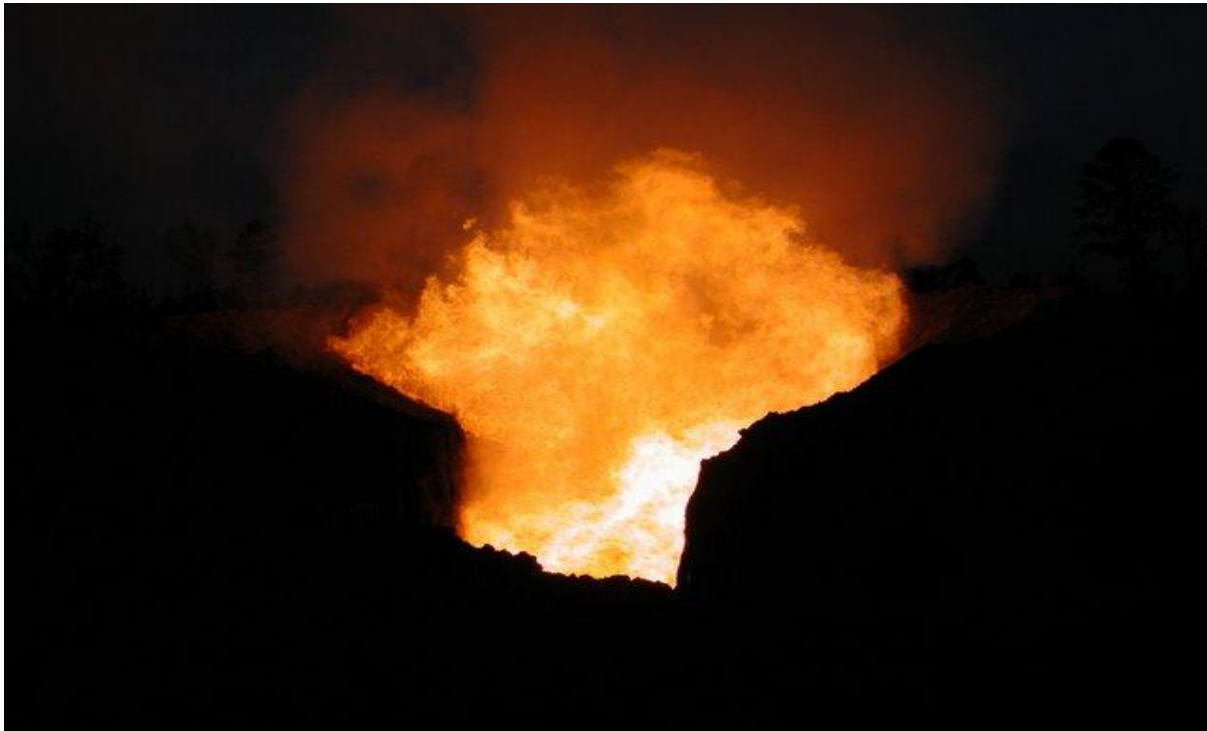
Figure 3: Flare at Vision Rice University VRU#1 demonstrating flow of hydrocarbons.

VRU#1 encountered pressures in excess of 13,000 psi together with the unexpected, presence of an unconsolidated rubble zone which contributed to well bore blockages. These factors combined ultimately lead to the well being plugged and abandoned in September 2009. Future wells will be engineered to accommodate higher reservoir pressures and unconsolidated rubble zones. The operator is confident of mechanical success in future wells and notes that the higher reservoir pressures and presence of unconsolidated rubble zones is particularly positive, typically indicating higher potential reserves and productivity.